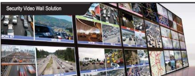
Security Video Wall Solution