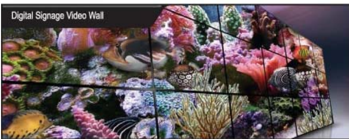
Quad Mutiplexer function