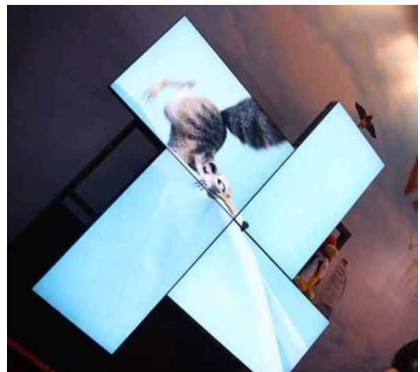
Irregular/Art video wall